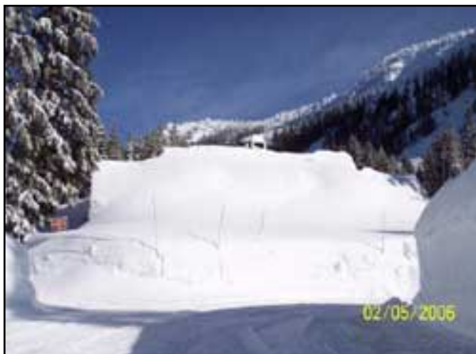
Crater Lake Headquarters was well buried