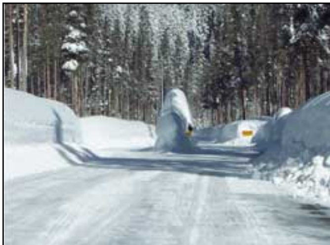
February's view of the South Entrance Station.

This year Crater Lake got an above average snowfall. As of June 16, 2006 there was still 38.0 inches on ground at Park Headquarters. Usually the average snow depth this date is 21.5 inches. This winter's total snow accumulation was 571.8 inches (10/1/05 through 6/16/06) and the average total accumulation this date is 520.5 inches. The average annual snowfall is 524 inches. The total precipitation accumulation has been 68.8 inches since 10/01/05.